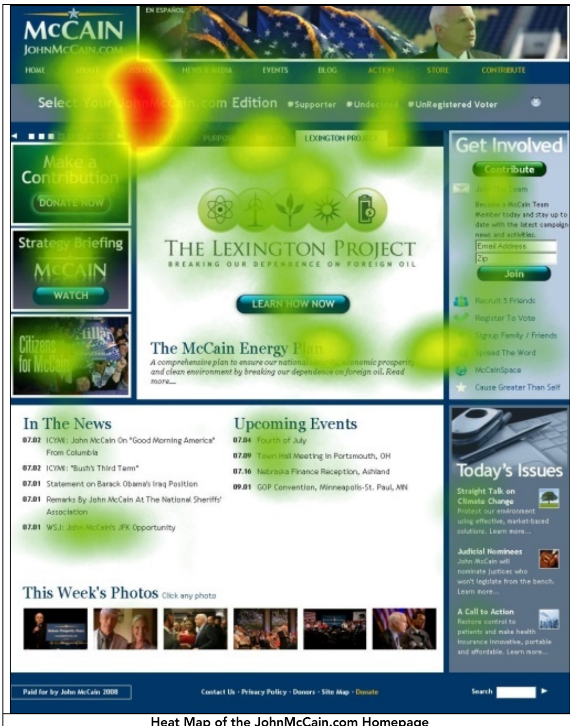
Heat Map of the JohnMcCain.com Homepage